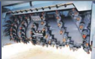
Optimized cutting angle