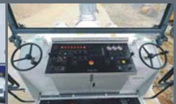
Considerate ergonomic design