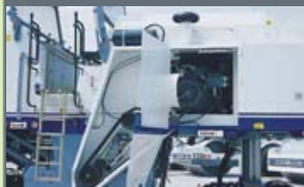
Considerate ergonomic design