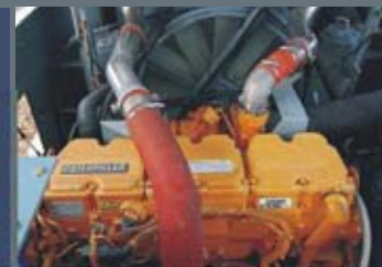
Electrical diesel engine