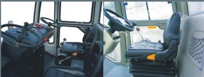
Tandem vibratory roller cab