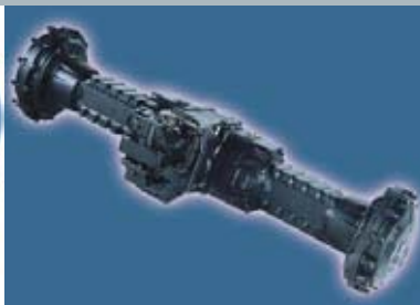
Imported American Dana original driving axle