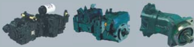
Famous high pressure pump and motor

Compacting meter is optional to meet more requirements of our customers.