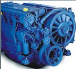
Imported German Deutz original engine